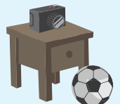
Items for reuse